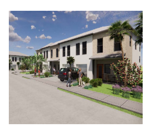
Longlake Preserve 54 Townhomes Largo