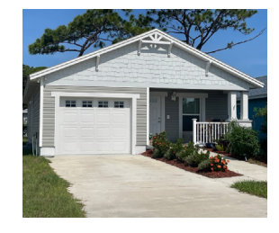
Little Road 24 Single Family Homes New Port Richey