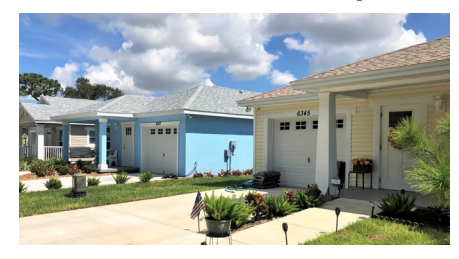
Gooden Crossing 12 Single Family Homes | Largo