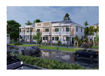
Shell Dash Townhomes 10 Townhomes | St. Petersburg