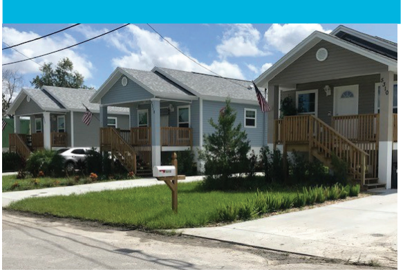
We were recognized as a Business of Pride Honoree by the Tampa Bay Business Journal.